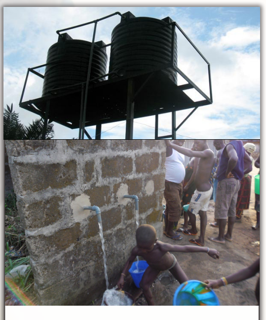
Clean Water Tank Location: Abere, Edo State - Nigeria