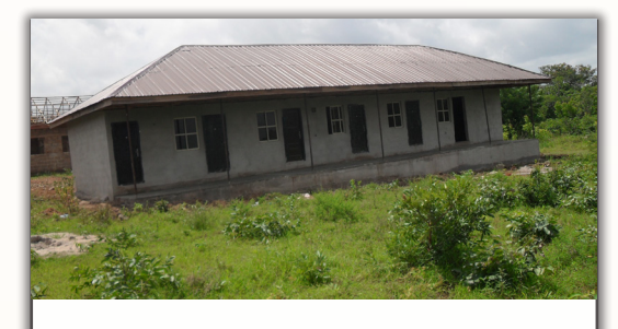
School Block for Ophans Location: Hope Orphanage, Idofian, Kwara State, Nigeria