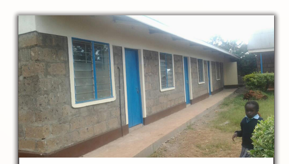
Elementary School Block WFPC Location: Waithaka, Nairobi, Kenya