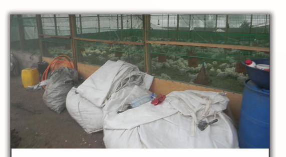
Micro Financed Chicken Farm Location: Buea. SW Cameroon